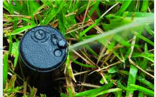
Gear driven rotor